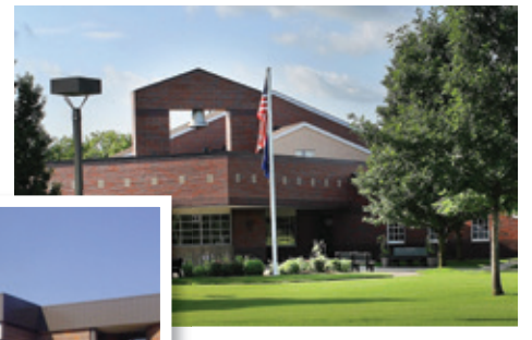
Orion Oaks Elementary School