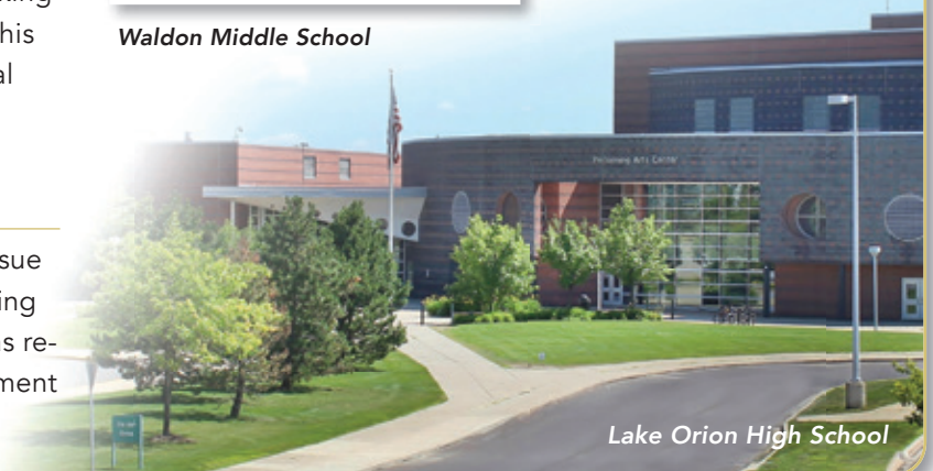
Lake Orion High School