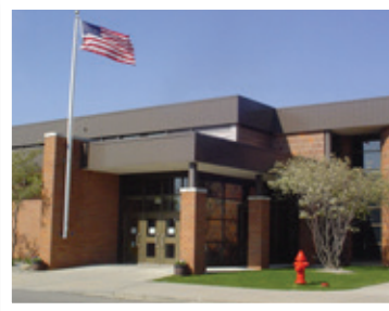
Waldon Middle School